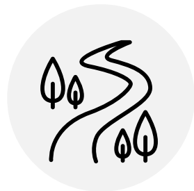
Off-Street Shared Use Paths